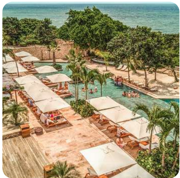
Markani Beach Club

Afternoon: Check-out and group transfer to airport