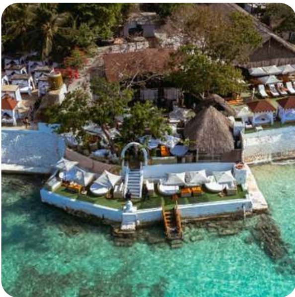
Bora Bora Beach Club