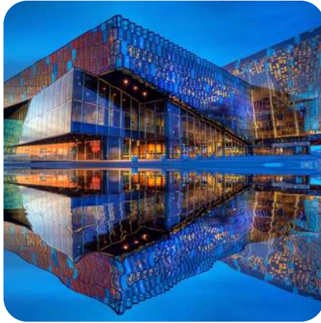
Harpa Concert Hall