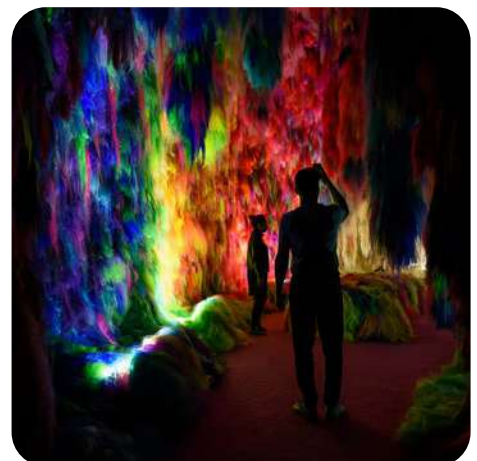
multi-sensory art installation Chromo Sapiens.

Optional Add-On: Reykjavík Art & Wellness Experience – gallery visits + a light wellness ritual overlooking the bay.