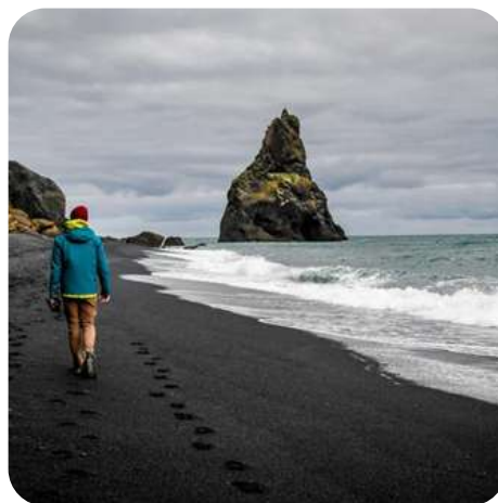
Reynisfjara black sand beach