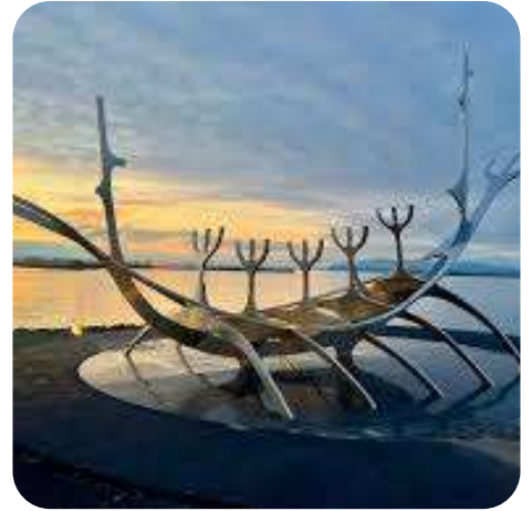
Sun Voyager sculpture

Optional Add-On: Taste of Reykjavík Food Experience – a curated tasting walk highlighting Icelandic seafood, baked goods, chocolate, and modern Nordic bites.