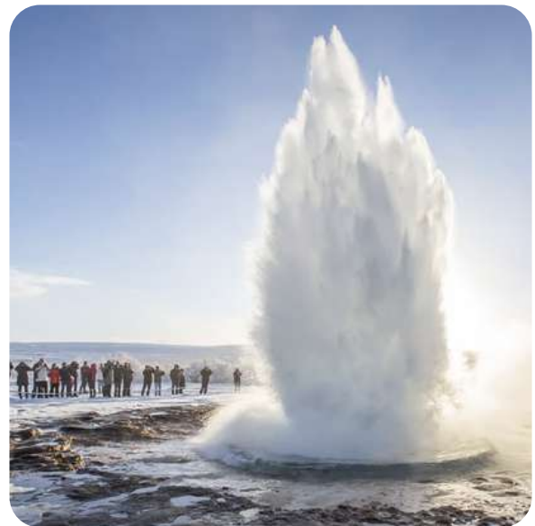
Geysir geothermal hot springs