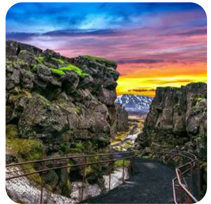
Þingvellir National Park

Evening: Evening: Welcome Dinner – a signature group gathering surrounded by panoramic views