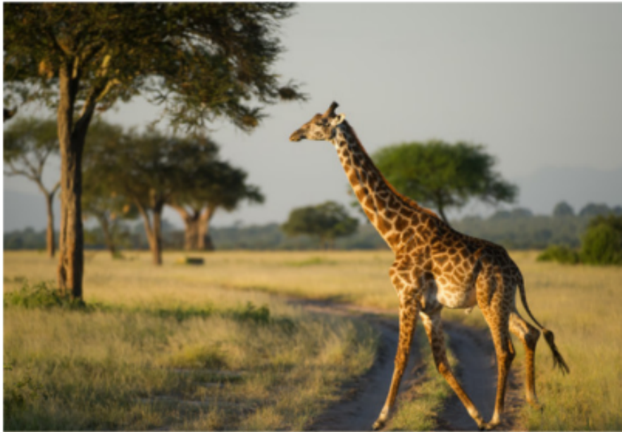
Giraffe crossing a safari trail in Tarangire