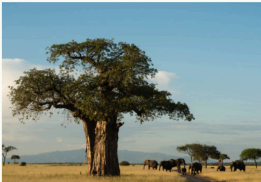
Baobab tree with elephants in Tarangire