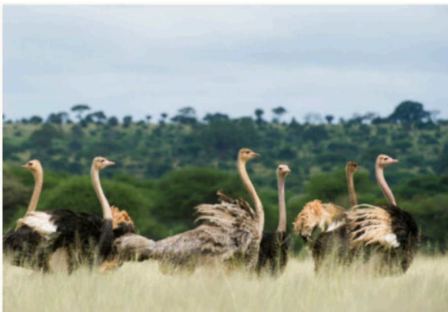
Ostriches on the lookout in Tarangire